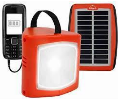
d.light S 300