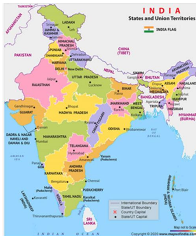
Figure 1: Map of India

The location of each clean energy installation as per a GPS location or verified address will be recorded in Micro Energy Credit's Credit Tracker Platform.