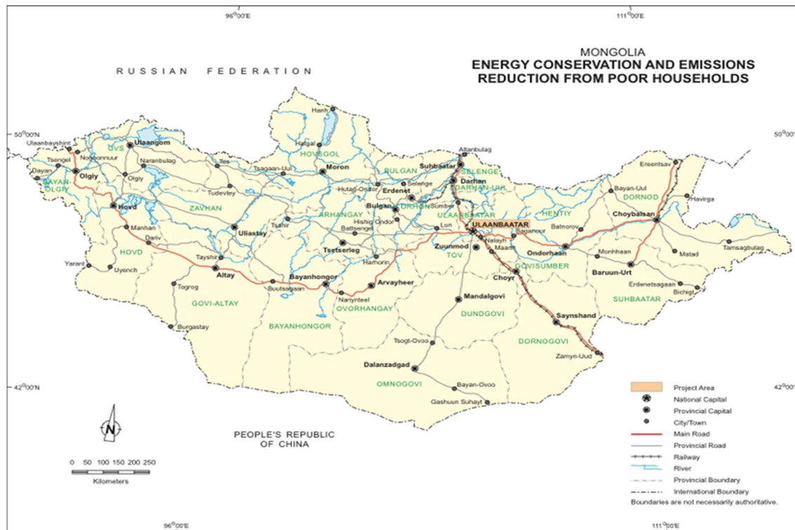
Figure A.2.1: National Map of Mongolia

The identification of each CEP installed and in use is possible through the information compiled in the Credit Tracker Platform. This information is constantly validated by the CME through spot-checks and will be available at validation and verification.