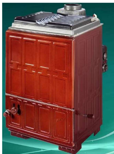
Fig B.1: Royal Improved heating technology

The stoves have a life expectancy of 15 years. The beneficiaries are informed about proper waste handling and disposal of scrap material due to end of life or non-operational product. Each user receives contact information of the VPA implementer at the time of sale. A unique numbering or identification system for the CEP installed is applied.