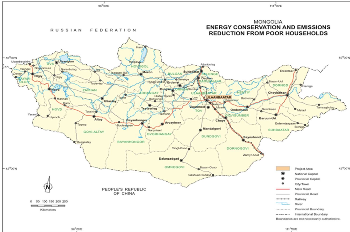
Figure A.2.1: National Map of Mongolia

GPS coordinates for Ulaanbaatar (focal point of VPA): 47.9200° N, 106.9200° E